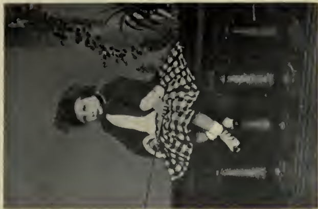
PRINCE WILLIAM OF PRUSSIA. (The present Kaiser) in 1867.